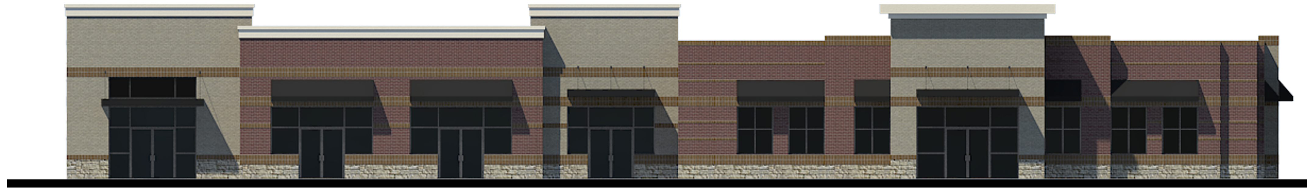
WEST ELEVATION 1/8" = 1'-0"