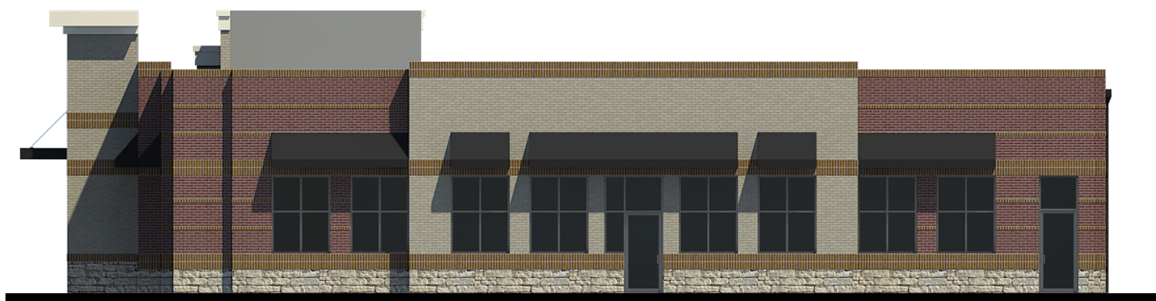
SOUTH ELEVATION 1/8" = 1'-0"